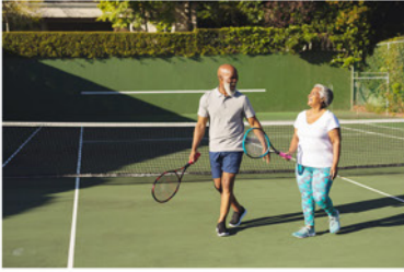
From the communities to the residents who call them home, the face of retirement living in Dallas is changing.