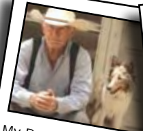
My Dog the Champion