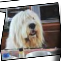
Abner the Invisible Dog