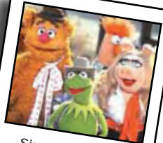
Sing-Along with The Muppet Movie!