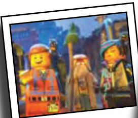
The LEGO Movie in 3D!

USA FILM FESTIVAL / KIDFILM 6116 N. CENTRAL EXPWY., STE. 105 DALLAS, TEXAS 75206