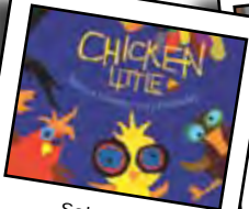
Salute to Rebecca & Ed Emberley