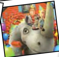
Otto the Rhino