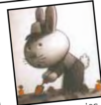
Favorite Stories Animated Short Films!

Celebrating Excellence in the Film and Video Arts